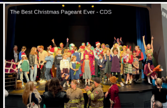
The Best Christmas Pageant Ever - CDS