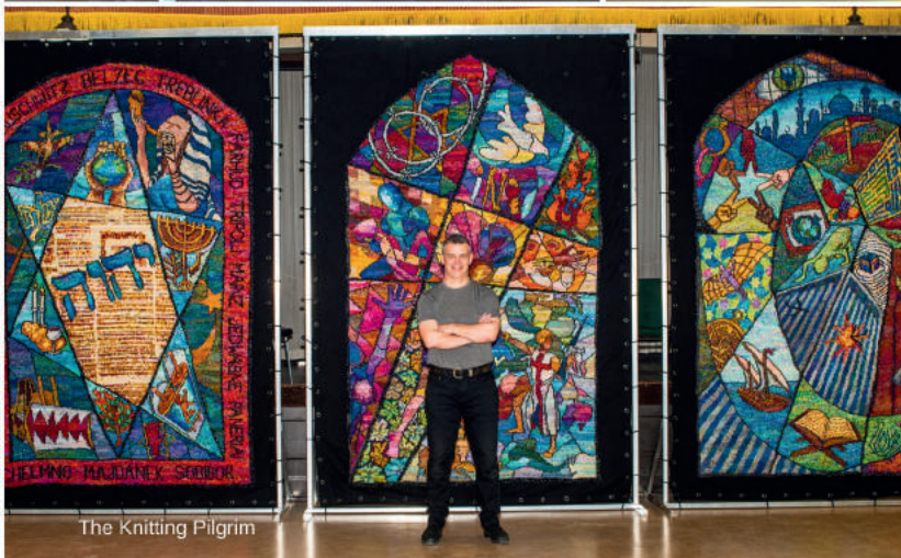
The Knitting Pilgrim