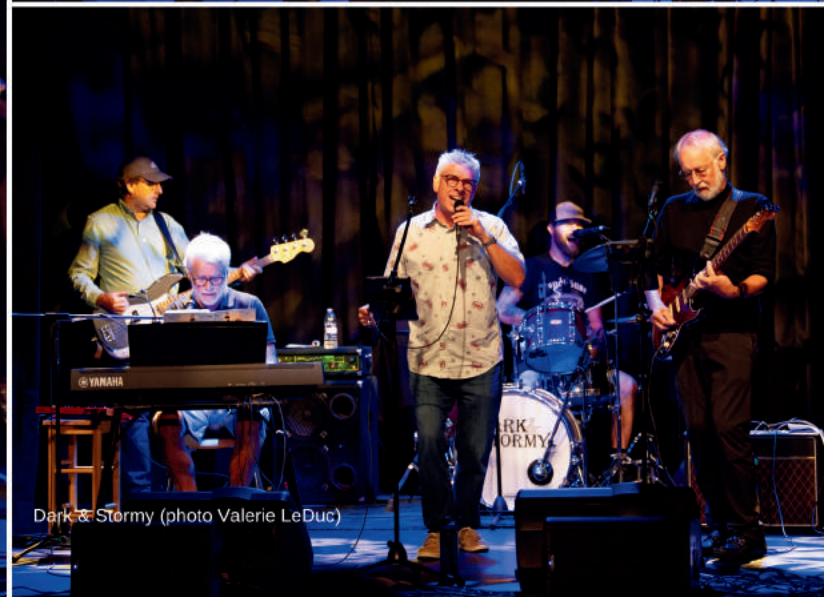
Dark & Stormy