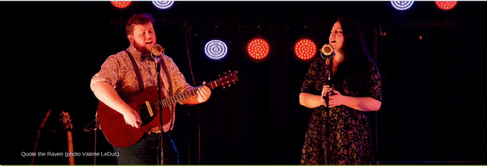
Quote the Raven