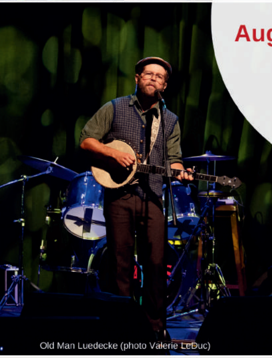
Old Man Luedecke