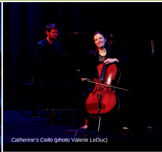
Catherine's Cello