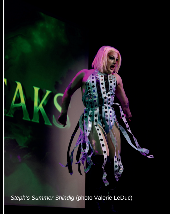
Steph's Summer Shindig