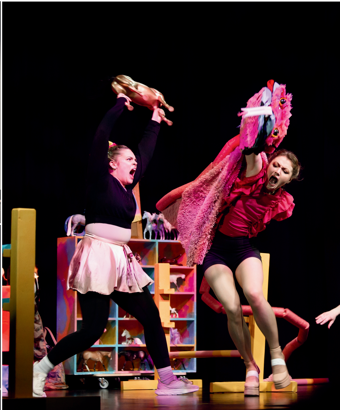
Horse Girls - From the FRINGE: 2 Hits from the Halifax Fringe Festival