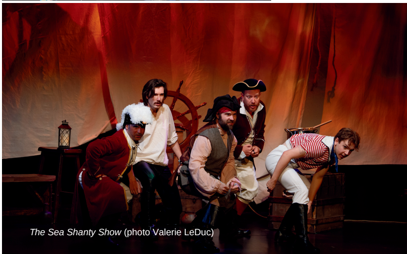
The Sea Shanty Show