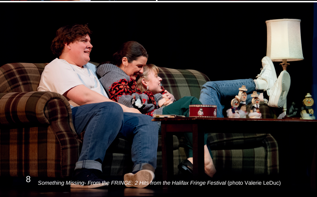
8 Something Missing- From the FRINGE: 2 Hits from the Halifax Fringe Festival