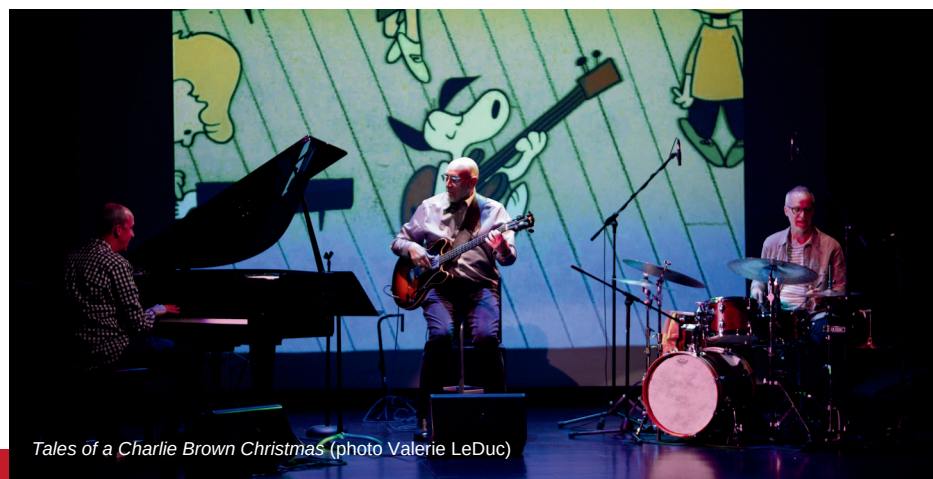
Tales of a Charlie Brown Christmas

Overall attendance was over 9,000 attendees, and the Playhouse continues to draw from Chester and well beyond. We saw growth in attendance from Halifax and the Lunenburg/Mahone Bay area, a sign that our reach and reputation continue to grow.