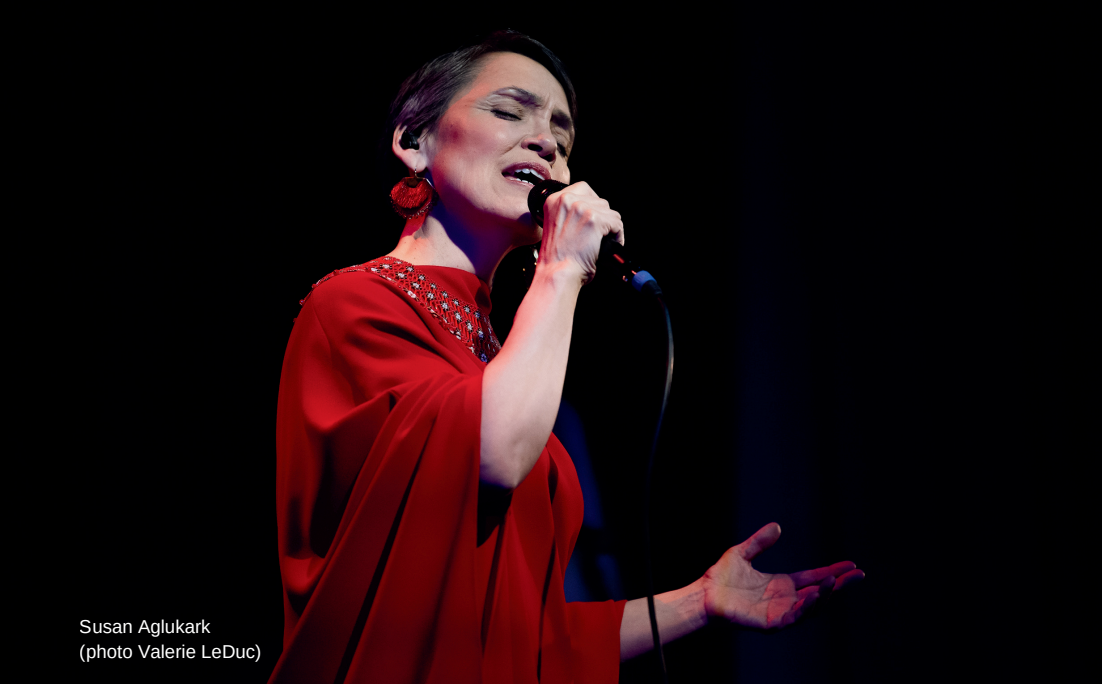
Susan Aglukark