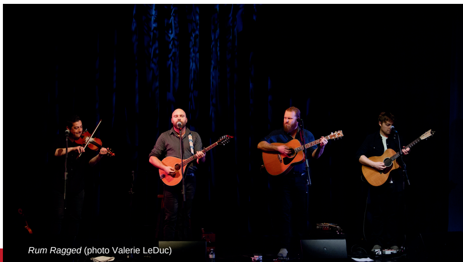
Rum Ragged