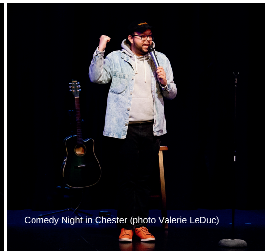
Comedy Night in Chester